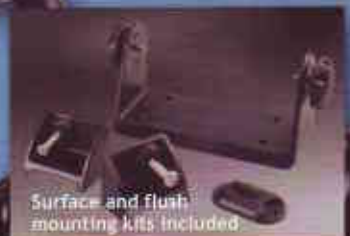
Surface and flush mounting kits included